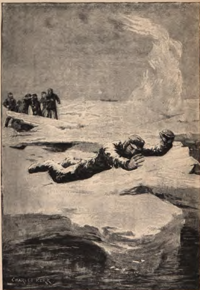
"He was lying face downwards upon a frozen bank."—See page 34.